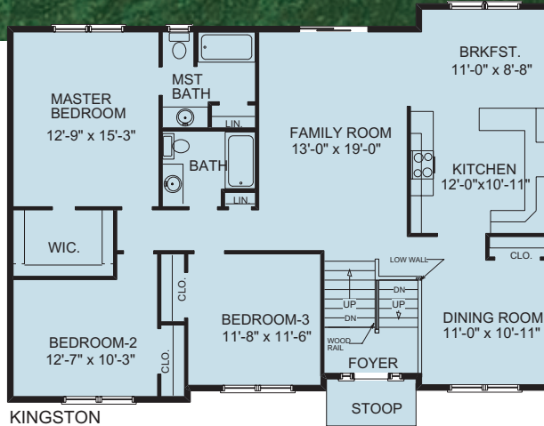
KINGSTON 48'-0" x 32'-0" 1568 SQ. FT.